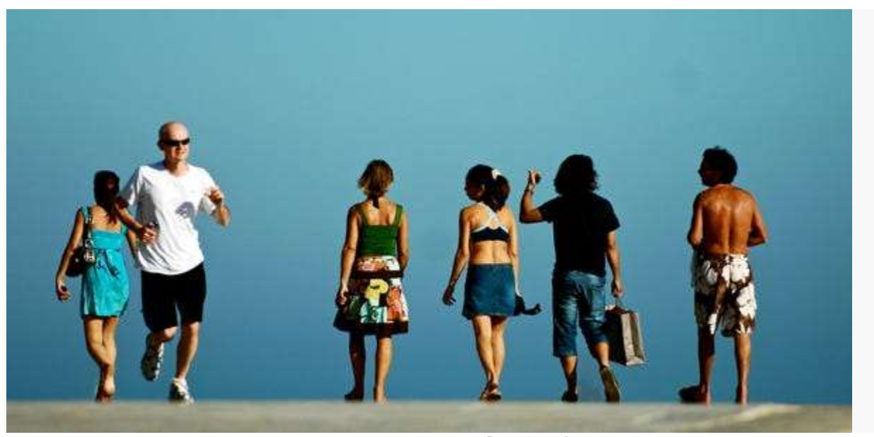
There is no perfect path to getting rich.

This is not a short-term project. We aren't talking days. We aren't talking months. We are talking years. Lots of years, and maybe decades. I didn't say this was a get rich quick scheme. This is a get rich path.